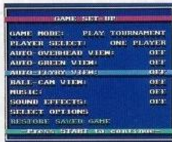
Game Set-Up Screen

You will need to use the GAME SET-UP screen every time you play PGA TOUR GOLF .