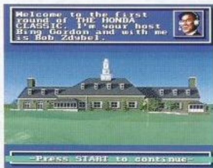
Clubhouse at Eagle Trace

Welcome to PGA TOUR Golf, the one game that lets you compete against the TOUR's most formidable pros on some of the finest, most challenging golf courses in the world.