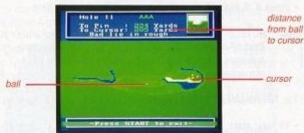
The 11th at Sawgrass

PLAY PGA TOUR Golf like a Pro—Take Your Best Shot!