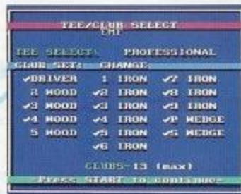
Tee/club select screen

WARNING: If you have saved a game and want to delete a player included in that game, be advised that the deletion of that player will result in the deletion of the saved game.